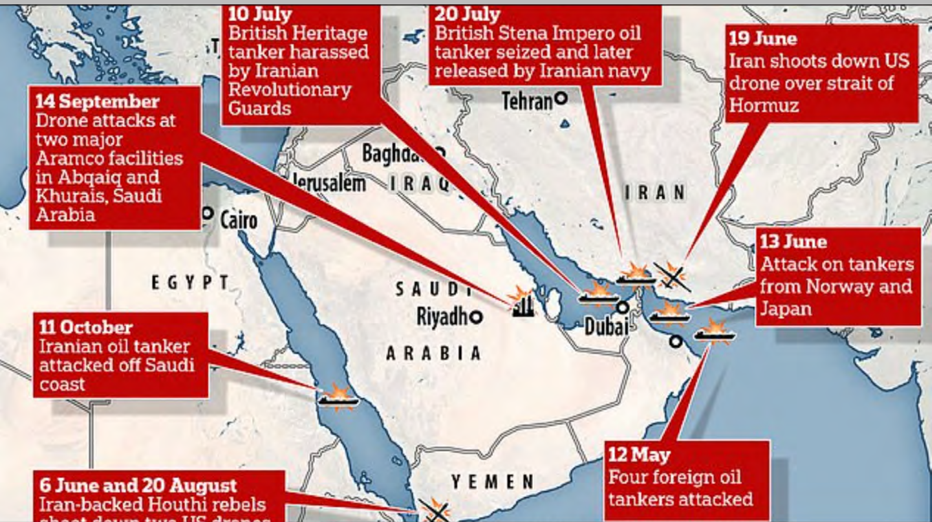
Last year, there were months of tensions around the Arabian Peninsula which has seen attacks on tankers, drones and oil facilities