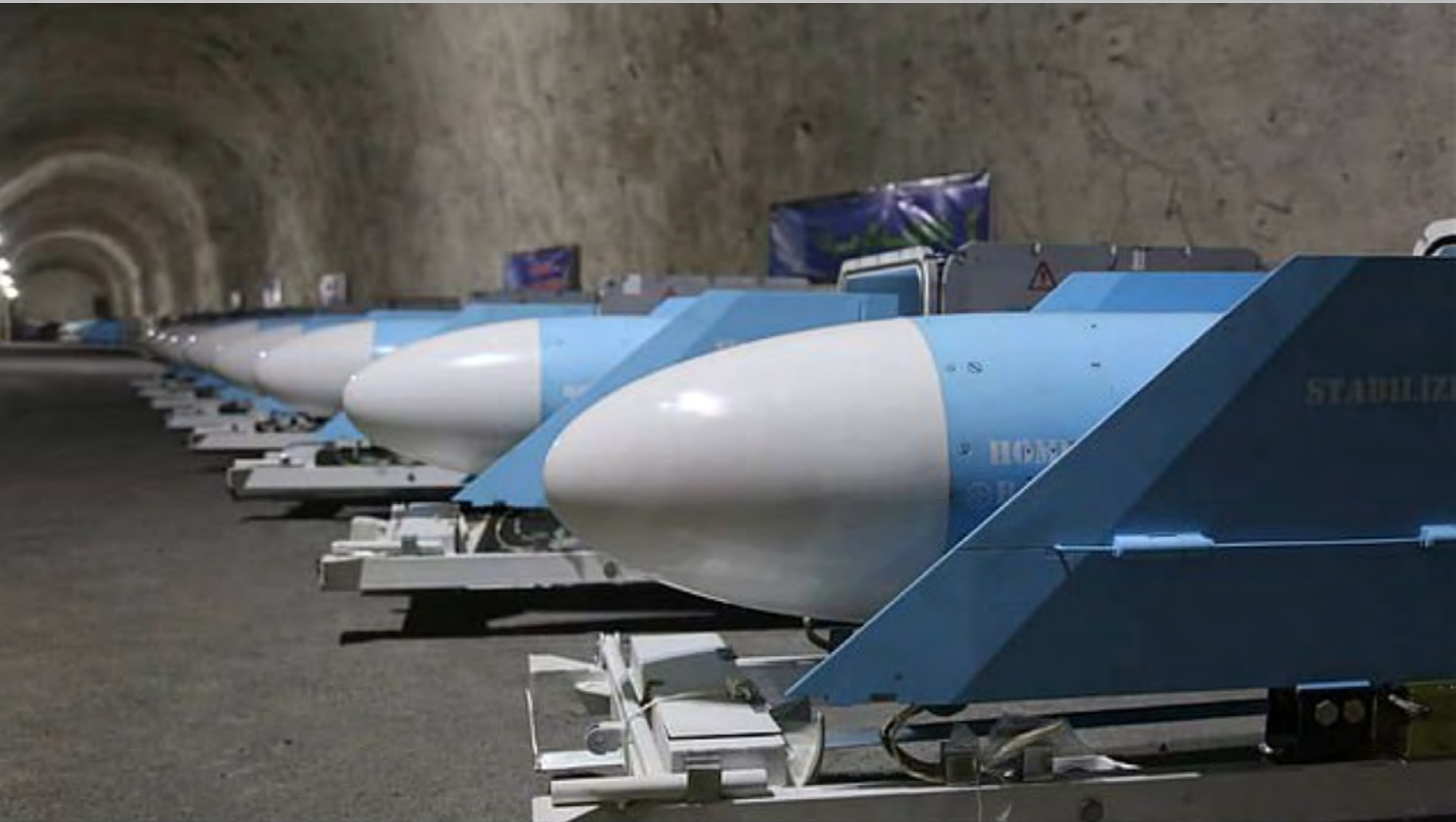
Last year, the Guards said Iran had built underground 'missile cities' along the Gulf coastline, warning of a 'nightmare for Iran's enemies'. Pictured: Missiles on display during an inauguration of a new missiles military base