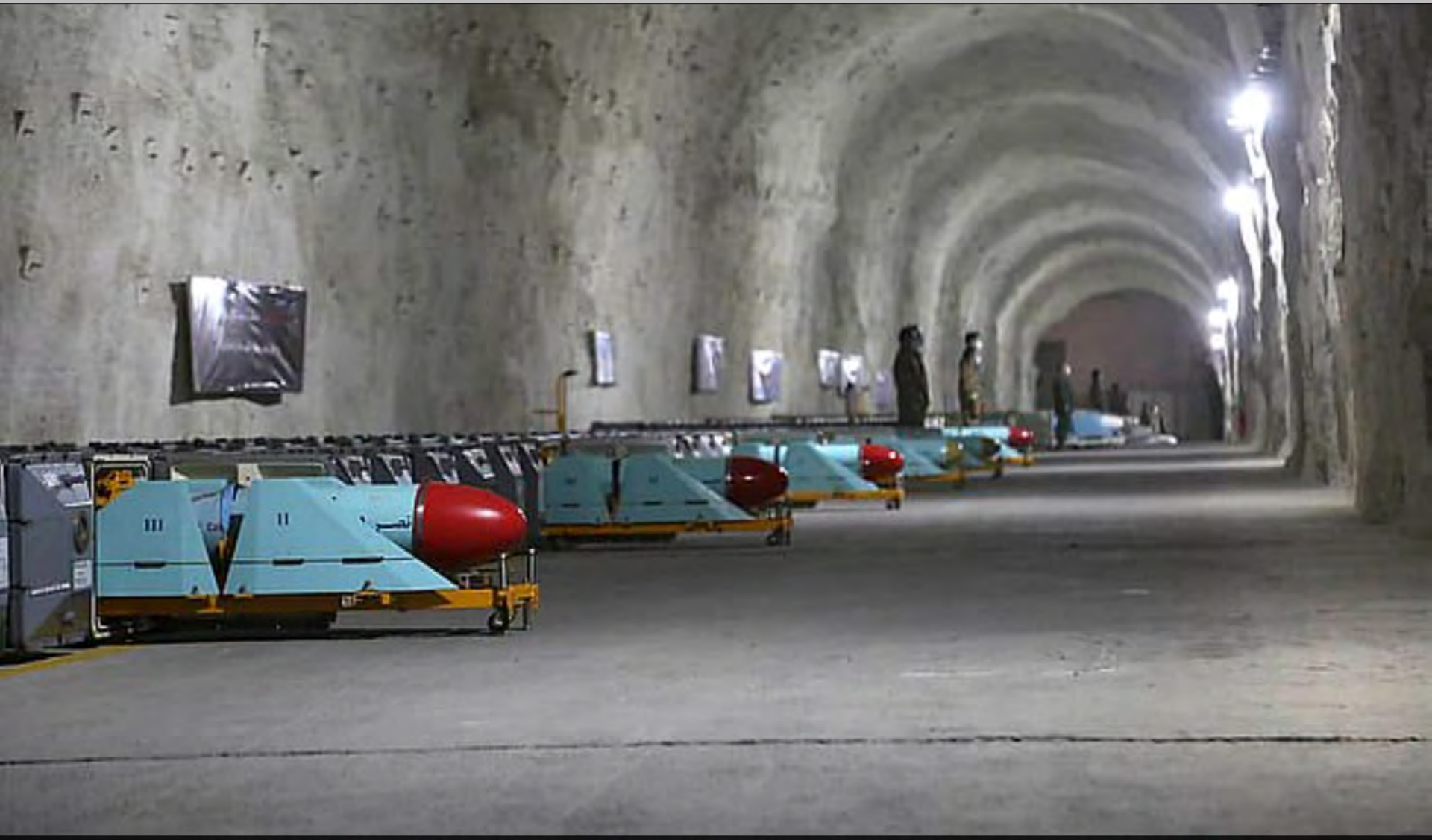
Scores of anti-ship missiles are placed under the careful watch of soldiers in the underground missile base at an undisclosed Gulf location