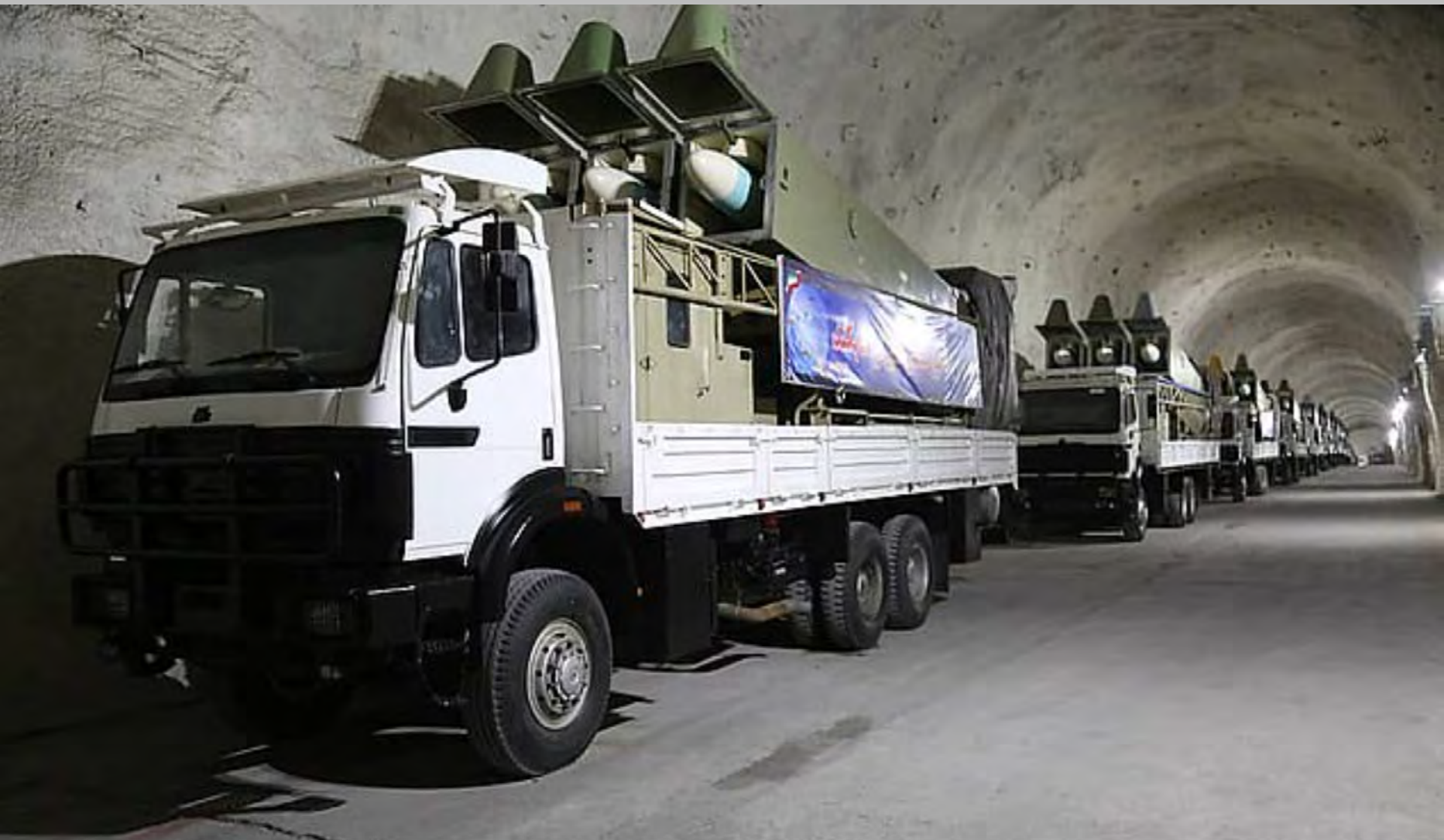
Iran's elite Revolutionary Guards unveiled an underground missile base at an undisclosed Gulf location today, Iranian state media reported