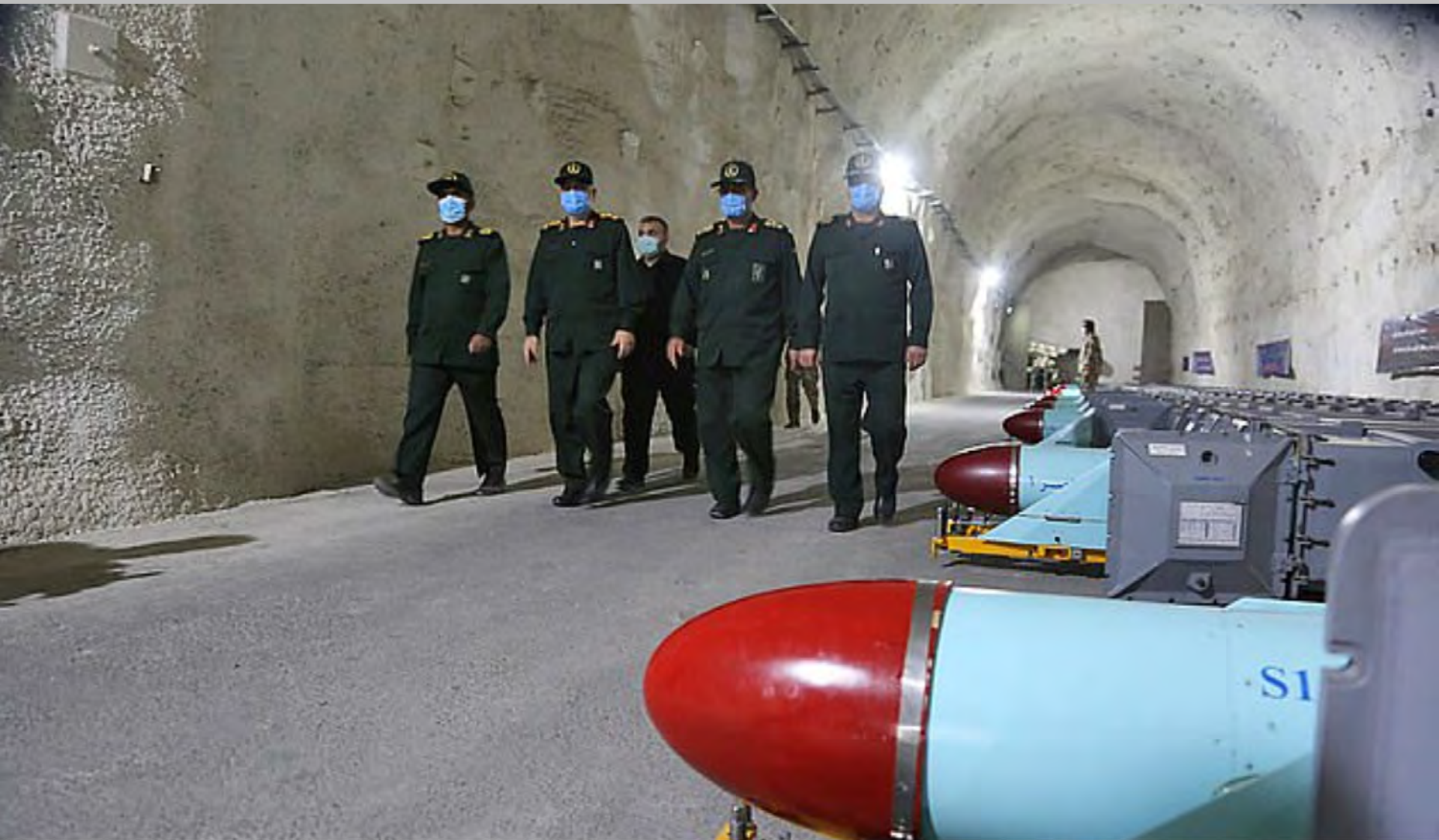
'The base is one of several bases housing the Guards' Navy's strategic missiles,' the state media quoted the head of the Guards, Major General Hossein Salami, as saying