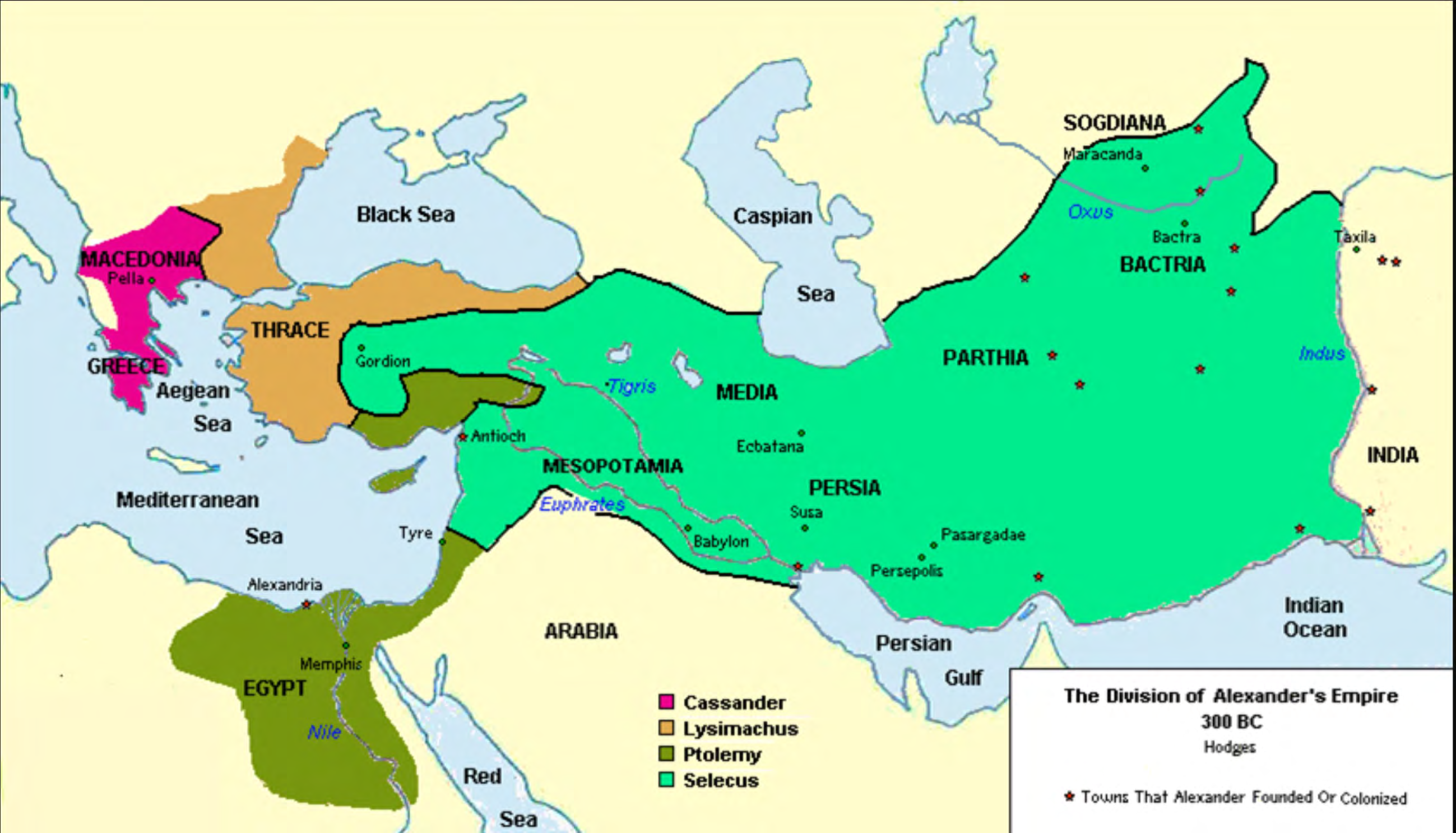
The Division of Alexander's Empire 300 BC Hodges

★ Towns That Alexander Founded Or Colonized