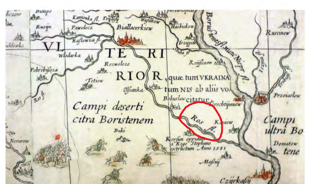
Map is from mid-1600s. It shows the Ros River flowing into the Dnieper River.

that Ros is a physical location, specifically, it is the river region at the center of Ukraine.